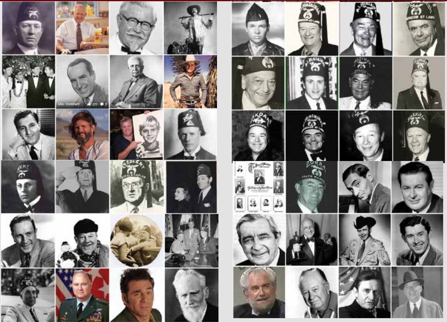
Sweetwater Shrine Club Search: Famous Shriners